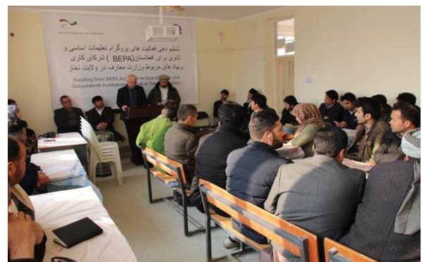
Handover Ceremony, Taluqan TTC, Takhar Province, 2017

In 2018-19, the Program focuses on the provinces of Samangan, Badakhshan, Balkh and Herat, and works on improving teachers' qualifications, especially at the primary level. BALEDU will engage TTCs, the Teacher Education Department (TED) and other relevant entities of the Ministry of Education (MoE) to improve teacher training and education. BALEDU will work with and through national institutions, to ensure sustainable capacity building and to create the frame to implement BALEDU innovations nation-wide