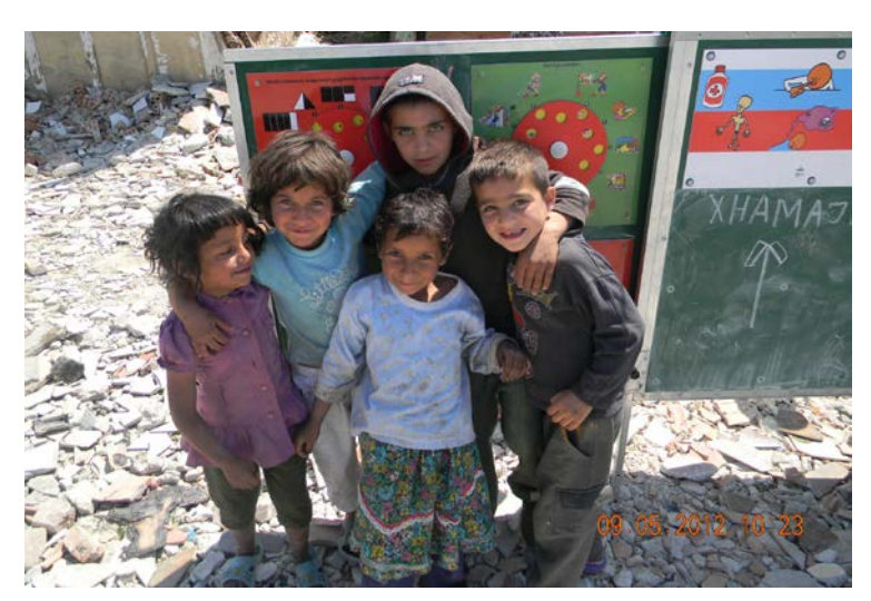
Roma communities are one of the segments of Albania's population with the least social care protection.

Albania's social safety net has to be strengthened so as to address conditions perpetuating poverty and vulnerability among marginalized communities. The current social protection policy focuses mainly on providing financial aid. The Support to Roma Social Inclusion Project, which is implemented by United Nations Children Fund (UNICEF), supports a social care reform that addresses the needs of the socially most disadvantaged population.