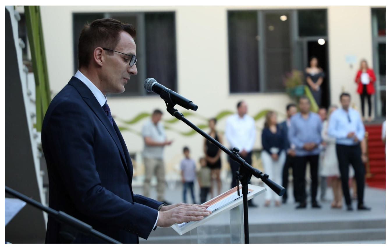
Dear fellow citizens and friends.

I am happy to present to you our newsletter 2023, reporting on key events of last year.