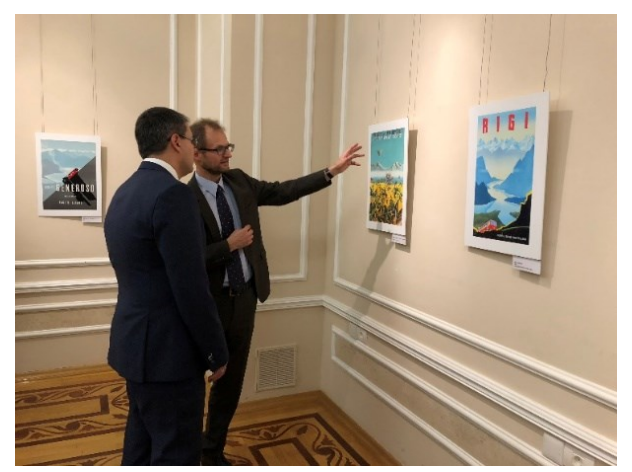
Ambassador Stalder presents a poster to the Deputy Minister of Culture and Tourism, Mr. Nazim Samadov

A vintage poster exhibition was organized by the Embassy at the National Art Museum of Azerbaijan in partnership with «Switzerland Tourism» in Baku in April. The exhibition aimed at promoting the tourism potential of Switzerland through some 50 posters during one century (1917-2017).