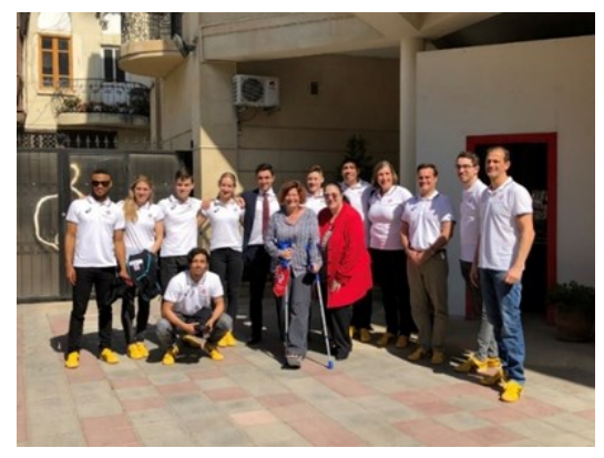
Athletes of the Swiss Gymnastics Federation at the Swiss residence

Several athletes of the Swiss Gymnastics Federation (Schweizerischer Turnverband) represented Switzerland at the 26th European Championships in Trampoline, Tumbling and Double Mini-Trampoline in Baku. The competition took place from 12-15 April 2018 in the National Gymnastics Arena in Baku.