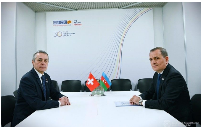
Cassis and Bayramov in Skopje

High-level meetings are an important pillar of bilateral relations between Switzerland and Azerbaijan. This year the ministers of foreign affairs, Ignazio Cassis and Jeyhun Bayramov met twice to hold wide-ranging discussions. On 20 September, the two met on the margins on the 78 th Session of the UN General Assembly in New York.