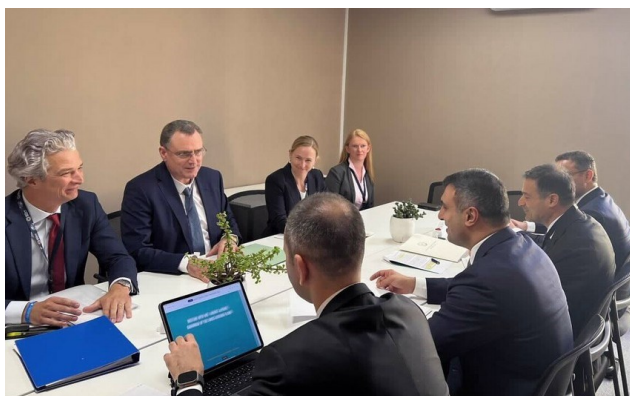
Swiss National Bank governor meets his Azerbaijani counterpart in Morocco