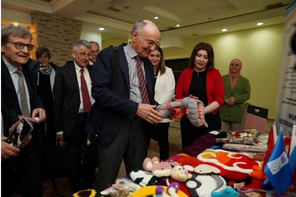
Members of Advisory Commission at Women Resource Center in Khazar, Baku

As part of their visit to the region, the Swiss Advisory Commission for International Cooperation visited Azerbaijan on 17 April 2023. The commission members, the Regional Director of the Swiss Cooperation Office, as well as representatives of local government and the State Committee for Family, Woman and Child Affairs met beneficiaries of the Swiss-financed regional Women's Economic Empowerment project (implemented by UNDP) at the Women's Resource Center in the Khazar district of Baku.