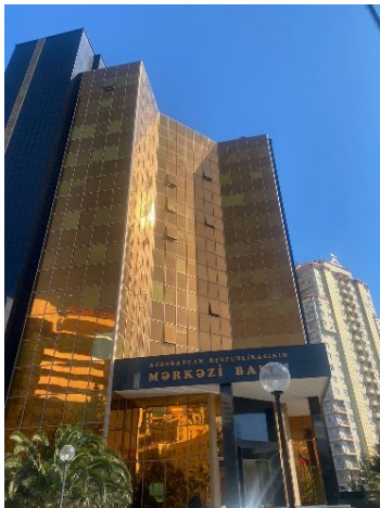
The Central Bank of Azerbaijan

Amendments to different laws regulating the financial sector in Azerbaijan, such as the Law on the Central Bank, Law on Banks, Law on Insurance Activity were endorsed in July 2023.