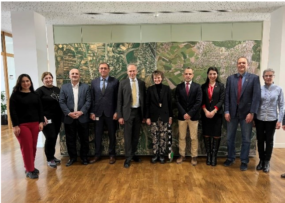
Calmy-Rey together with the Swiss Embassy staff

The former President of the Swiss Confederation, Micheline Calmy-Rey attended the 10 th Global Baku Forum "The World Today: Challenges and Hopes" held on 9-11 March 2023. She joined a panel discussion entitled "Building stability in a divided world: Its impact on global peace" and delivered a speech. According to Azerbaijan's state news agency Azertac, Calmy-Rey spoke about finding solutions to peace, as well as the new world order we are facing today.