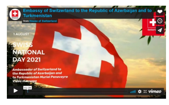
Video message – ambassador's greetings on the occasion of the Swiss National Day (1 August)