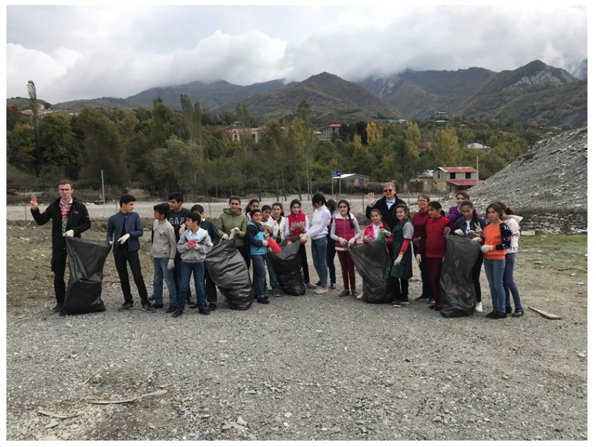
Schoolchildren cleaning up the village from waste

Lakes, mountains and clean air are associated with Switzerland's quality of life. As beautiful nature is an integral part of Switzerland's identity, the government actively promotes the protection of the environmental heritage throughout of the globe.