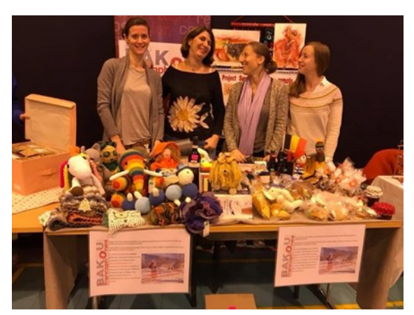
Booth of Bakou Francophones at TISA

The annual winter fair was organized at the International School of Azerbaijan (TISA) on 1 December. The Swiss Embassy participated at it in the frame of the organization Bakou Francophones together with other Embassies from French speaking countries (Belgium and Romania). Money from the sale of items were given to the Camping Azerbaijan and the NGO will buy toys for children living in remote mountainous villages. The project called "Santa Claus in remote villages", will start from 22 December and continues until 1 January 2019.