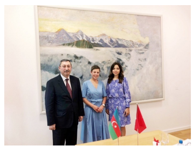
Deputy Secretary of State Krystyna Marti (middle) welcomes Deputy Foreign Minister Khalafov and Azerbaijani Ambassador to Bern, Hanum Ibrahimova

The political consultations between Switzerland and Azerbaijan took place in Bern on 21 September 2018. Swiss Deputy Secretary of State, Krystyna Marty Lang, met with her counterpart, Deputy Foreign Minister Khalaf Khalafov, to discuss a wide range of bilateral issues. Both sides emphasized the positive dynamic of relations and highly appreciated the outcome of the meeting. The settlement process of the Nagorno-Karabakh conflict, the economic cooperation as well as topics related to the educational sphere were equally discussed.