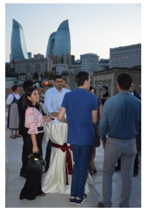
Young alumnis enjoy wonderful view from the terrace of the residence

The Embassy gathered Azerbaijani students and graduates from the Swiss universities and schools at a reception given at the Swiss Residence. This year's Alumni Networking Event took place on 7 September and dozens of young people enjoyed their attendance at the roof terrace in beautiful Icheri Sheher. For the first time, the CEO's of Swiss companies operating in Azerbaijan were also invited. This created an opportunity for students to expand their networking and even seek for job opportunities.