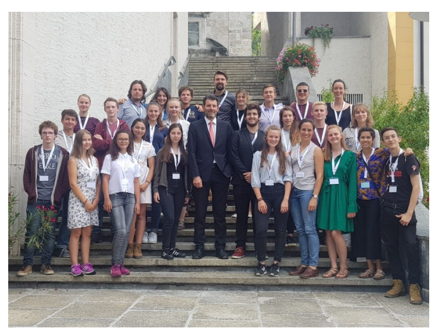
The State Secretary Roberto Balzaretti with the group of youth

Once a year during summer, the Organisation of the Swiss Abroad (OSA) holds a congress for Swiss citizen living all around the world. This event has become very popular among the members of the "Fifth Switzerland" . The subjects are picked to match the interests of Swiss people living abroad.