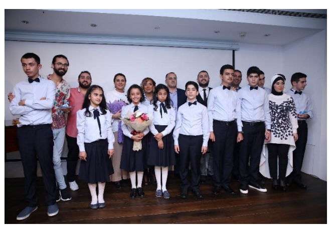
Chorus concert of talented children

Another performance of an arts & culture project supported by Switzerland was held in Baku, Sumqayit and Quba in October.