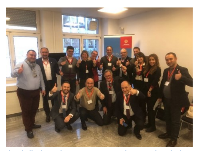
Azerbaijani travel agency representatives say the mission was successful

On invitation of Switzerland Tourism, a group of ten representatives of Azerbaijan's travel agencies visited Switzerland at the end of November 2018. The aim of the visit was to promote the direct flight recently introduced between Baku and Geneva and to provide first-hand information about Switzerland as a touristic destination. Ultimately, the visit should contribute to increase the number of tourists in both directions.