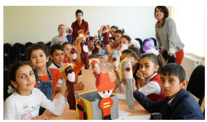
Children proudly show their handmade puppits

Living near the frontline of an unsettled territorial conflict must be an extremely difficult experience for civilians on both sides of the border in most case. This is even truer for children fighting with symptoms of stress and psychological trauma caused by regular exchanges of fire.