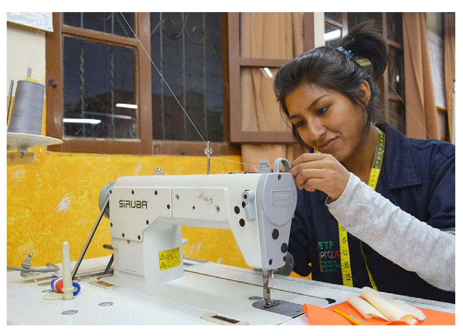
With the support of Swiss Cooperation the Alternate Education Centers trained more than 18 000 young people and adults since 2006 – more than half of them women.