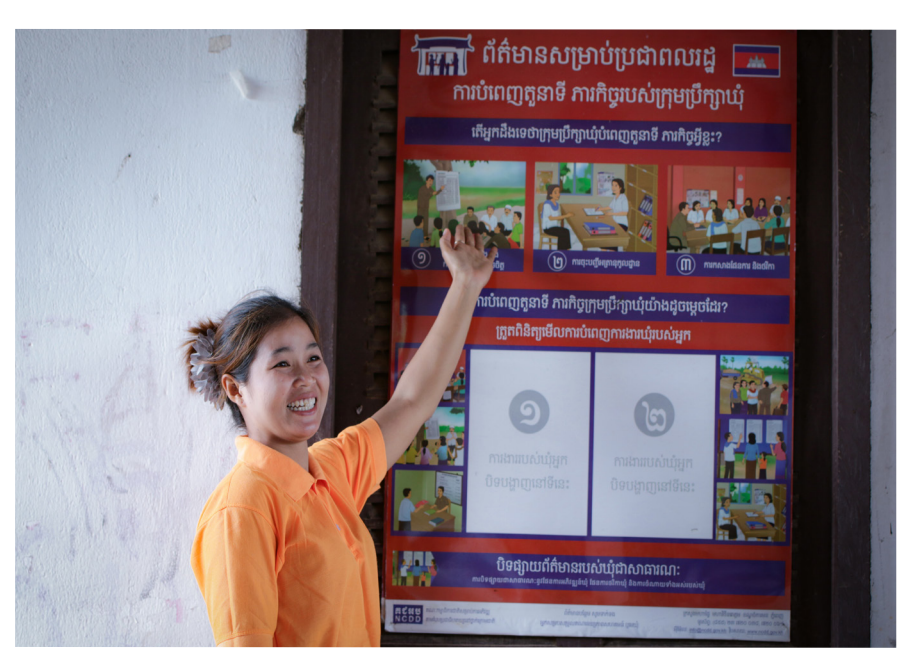
Community Accountability Facilitator presents service standards for communes