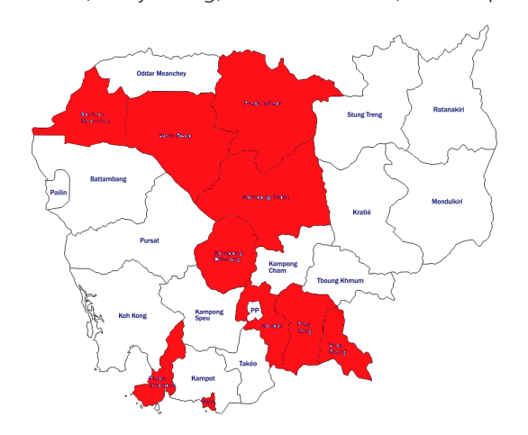
Target provinces highlighted in red colour

The target group includes the service providers (supply side) of nationwide sub-national level (commune/Sangkat and district/municipal administrations, health centres, and primary schools), and all citizens, both men and women (demand side) in ten provinces of Banteay Meanchey, Siem Reap, Preah Vihear, Kampong Thom, Kampong Chhnang, Prey Veng, Kandal, Svay Rieng, Preah Sihanouk, and Kep.