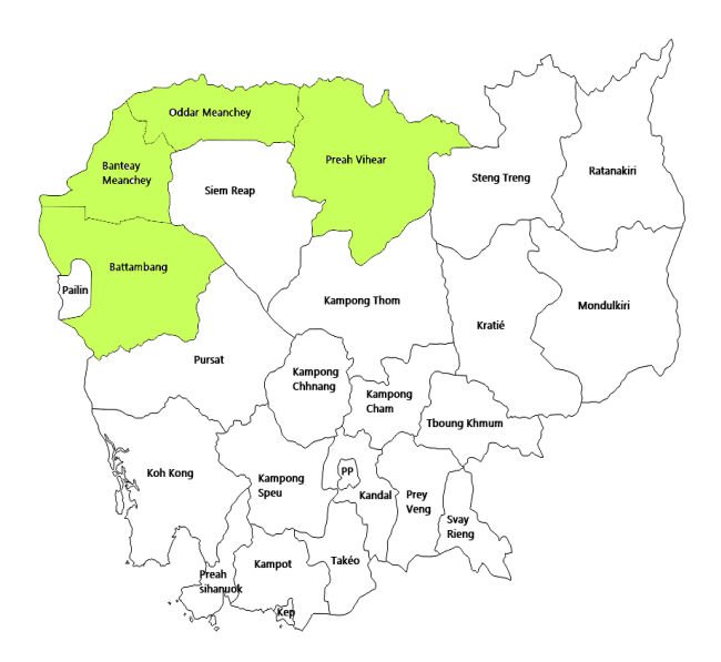
Target provinces highlighted in green colour

In its first phase, 15,000 households (70,500 men, women, and LNOB people) living in 36 communes of 12 districts in the four provinces of Oddar Meanchey, Preah Vihear, Battambang, and Banteay Meanchey will directly benefit from improved access to public and private services, become more resilient to climate change, and have increased incomes through agro-ecological farming systems, and approximately 88,000 will benefit indirectly.