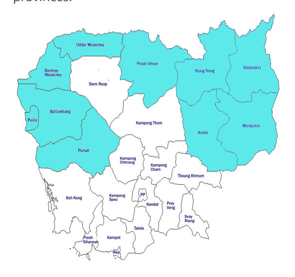
Target provinces highlighted in blue colour

Disadvantaged young people with low-level education and low-skilled workers. Teachers, instructors and management staff of public TVET institutions, personnel of other government institutions as well as owners of small businesses also benefit from the programme. SDP phase II covers the 10 provinces of Preah Vihear, Stung Treng, Kratie, Ratanakiri, Mondulkiri, Pursat, Battambang, Pailin, Banteay Meanchey, Oddor Meanchey, while some interventions go beyond these provinces.