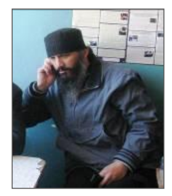
Priest, Zanavi Village

'Women and Men are equal in front of God - but the church empowers men to lead families. Everybody here agrees with the fact that women play very important role in farming and housekeeping. God created both a man and a woman to be 'one soul and one body', but the man is the one who has to lead a family on the right way.'