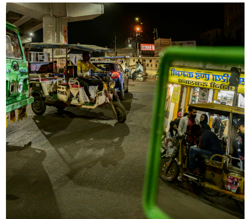
Lead photo, photos 1 and 3 Taha Ahmad © SDC, photo 2 Ranita Roy © SDC