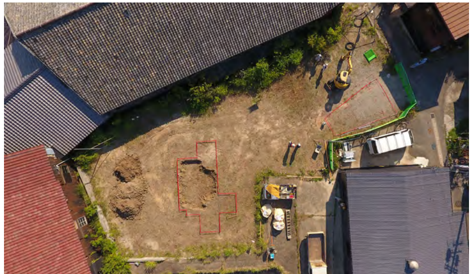
Surrounded by an old pottery factory. View of the site in early July 2022 before construction

At the heart of the project is the fabrication of the hanging pottery chains. While the pattern appears to be random at first glance, its generation requires an intricate algorithm, an algorithm that brings human and machine together. The pottery chains are created by a series of feedback processes between a person and a robot. Each person makes a uniquely defined shape of pottery chain by holding it so that it hangs from their arms without touching the ground. The robot then finds a location on the beam for its installation within the given dimension of the beam and structural requirements. The final design of the overall patterns, made of forty-five of the hanging chains, are generated by children and adults with different physiques and strength reflecting their individuality into the whole.