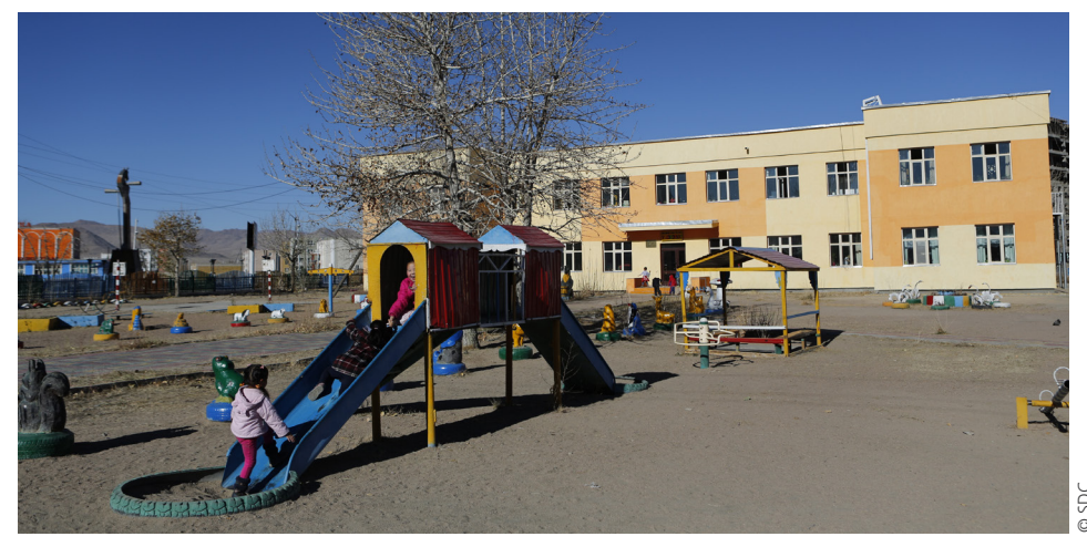
The kindergarten No 5 in Jargalant soum, Khovd aimag was the first thermo-retrofitted building by the PIE 1.

Public Investment in Energy Efficiency Project Phase II (PIE2) aims to increase effectiveness of Public Investment Management (PIM) and of Public Finance Management (PFM) replicating and upscaling the achievements of PIE1 in the two poorest districts of Ulaanbaatar city. Improved PIM and PFM capacities, practices, procedures and regulations will be applied to the thermoretrofitting of public buildings, i.e. 20 schools and kindergartens, aiming for demonstration effect for replication.