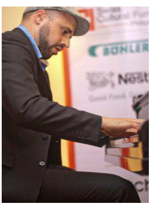
Swiss jazz pianist-composer Claude Diallo in Manila