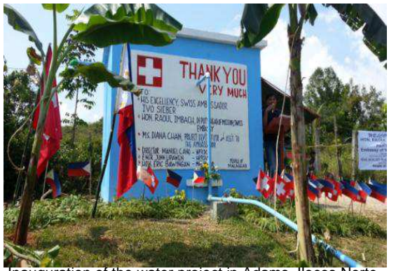
Inauguration of the water project in Adams, Ilocos Norte

Yolanda has also affected our Swiss compatriots living in the Visayas. The Embassy, in close cooperation with the Crisis Management Center of the Federal Department of Foreign Affairs in Berne, intensively worked to locate Swiss nationals in the affected areas days after the typhoon. Teams of consular employees of the Embassy in Manila, and staff flown into the country from Swiss Embassies abroad, have been deployed to actively search for our compatriots in heavily affected areas or those difficult to reach. The Embassy helped a number of persons to get out of danger zones, receive medical treatment, or get repatriated to Switzerland if necessary. However, no Swiss citizen was among the numerous casualties.