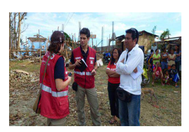
Construction specialists of the Swiss Humanitarian Aid Unit discuss emergency response measures with local experts in Daan Bantayan