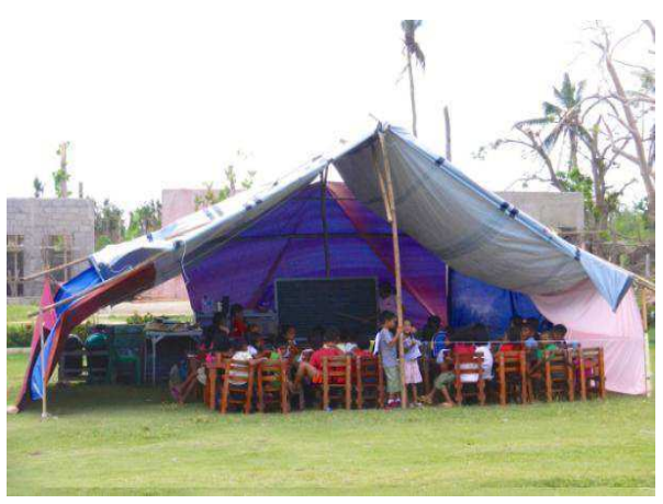
Temporarily installed tarpaulins provided by Switzerland allow classes to resume in a provisory school in Daan Bantayan.