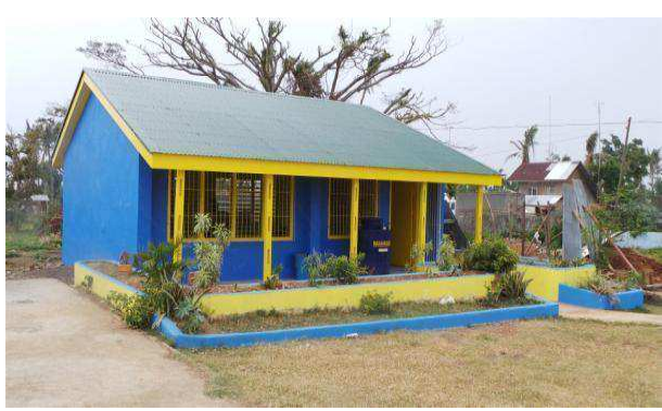
A classroom rehabilitated by Switzerland is ready for the start of classes

In the recovery phase in 2014, projects were initiated in the area of livelihood. For instance, fishermen were provided with new boats or were financially supported to repair their damaged boats in order to allow them to restart their businesses and generate income. Rice seeds were distributed to local farmers so that they could secure the next harvest. Switzerland also supported the rehabilitation of social infrastructure including the temporary provision and rehabilitation of 32 classrooms and health centers by both financial assistance and expertise. Furthermore, pumping stations, water systems, and springs were repaired or cleaned to re-establish the supply of drinking water. All activities included capacity building for local partners, aiming to raise awareness of Disaster Risk Reduction.