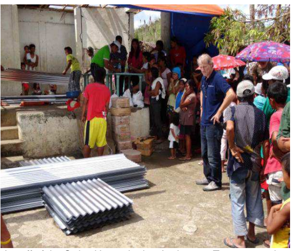
A staff of the Swiss Humanitarian Assistance Team supervises the distribution of shelter kits to disaster victims.