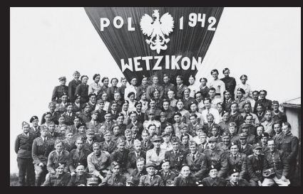
(1942, Polish Museum Rapperswil)

During World War II, more than 13,000 soldiers of the 2nd Polish Rifle Division were interned in Switzerland. where they had the opportunity to pursue an education and helped build major infrastructure projects.