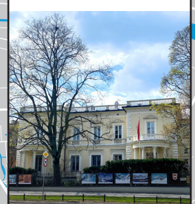
The Embassy building today.