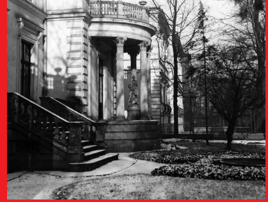
The Embassy gardens before World War II.