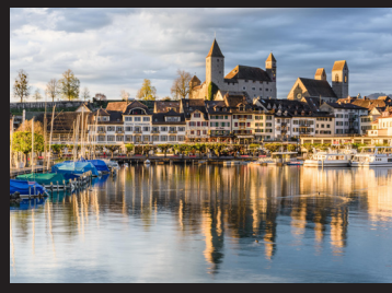
Count Władysław Broel-Plater founded a Polish Museum in Rapperswil Castle in 1870