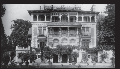
Ignacy Paderewski lived for almost 40 years at Riond-Bosson, a property he bought in western Switzerland in 1899