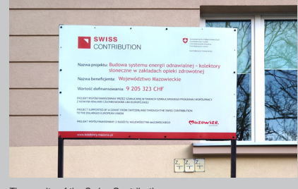
The results of the Swiss Contribution are still visible today across Poland

Between 2007 and 2017, Poland was the largest partner country for Switzerland's contribution to the enlarged EU. Fifty-eight projects were successfully implemented for a total of CHF 464.6 million (PLN 1940 million in current prices). The funds were used for a variety more about the projects of initiatives, including promoting renewable energy, strengthening joint academic research, investing in local railway transport, supporting SMEs and start-ups, and protecting biodiversity.