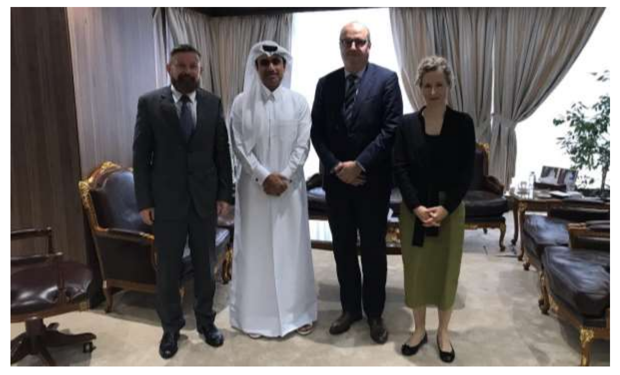
From left to right: Ambassador Edgar Doerig, Under-Secretary for Labour Mohammed Hassan Al Obaidly, Ambassador Pietro Mona and Simone Troller discussed the situation of migrant workers in Qatar.

Various reforms were announced by the Qatari Government in recent months and relevant decisions taken just a couple of days ago. These include an important increase of the non-discriminatory minimum wage, the abolition of the required exit visas for many occupational groups, a lift of non-objections certificate as a prerequisite for changing jobs, the operationalization of the Wage Protection System as well as training of 270 labour inspectors.