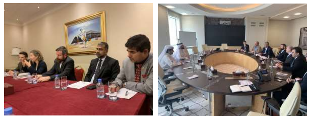
Images: Meeting between Swiss parliamentarians, representatives of the Swiss Embassy and Labour Attachés from various Asian Embassies. Meeting at QIA.

A guided tour of the construction site of the World Cup's Final Stadium in the new town of Lusail and a meeting with the CEO of the Qatar Investment Authority (QIA) were also on the agenda. Hosting the international IPU Congress was an important success for the Government of Qatar and provided an excellent opportunity for MPs to get familiar with the host country.