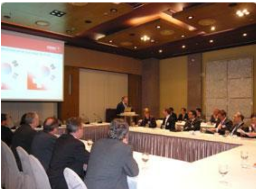
► SBHK Business Seminar

A trip organized in cooperation with the Swiss Asian Chamber of Commerce (SACC) / KOTRA and the Swiss Business Hub Korea (SBHK) brought 13 Swiss companies together to Korea from January 9 - 15, 2011 to explore potential business opportunities. During a seminar organized by SBHK about the Korean economy and cultural aspects on how to master business in Korea participants gained a meaningful insight into possibilities for doing business in the Land of the Morning Calm but also into the daily issues of foreigners managing businesses in Korea. Several Korean, German and Swiss speakers provided an in-depth picture about "Doing Business in Korea".