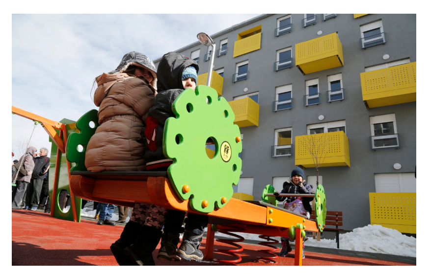
Apartment building, in Ovca, Serbia.