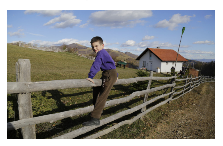
Individual house in Foča Ustikolina, Bosnia and Herzegovina.

All stakeholders unanimously agree that the programme also contributes to an improved regional cooperation and to national and regional reconciliation. Additionally, the RHP is making an important contribution to poverty reduction, social inclusion and economic empowerment as well as supporting Bosnia and Herzegovina, Montenegro and Serbia in their EU accession process. Even so, the initiative can become a model for the resolution of long lasting refugee and internal displacement crises worldwide.