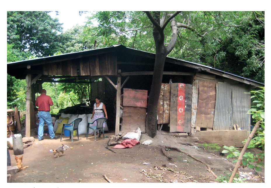
Farmer's house, Nicaragua.