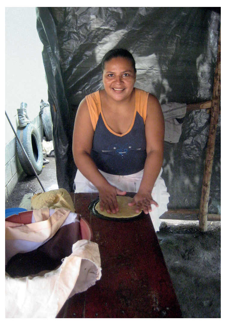
Woman preparing food, Nicaragua.

to achieve equitable and sustainable food security and development. For other regions of the world, there are similar legal and policy instruments, such as for example the consensus documents adopted at the Regional Conference on Women in Latin America and the Caribbean (Action Aid 2010: 13-15; OHCHR/UN Women 2013: 11-13).