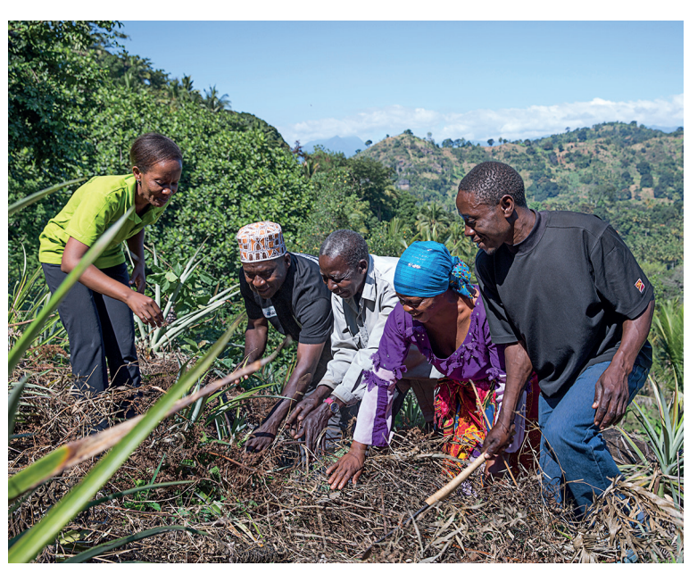
Training in agricultural technics, Tansania.

should be gender-sensitive ; tools as well as land budgeting should be participatory and reflect an integrated gender perspective ; and they should track how budgets respond to gender equality commitments and targets. This needs to be accompanied by gender-sensitive and sex-disaggregated data collection on access to, use and control of land, as well as monitoring and evaluation involving women (FAO 2010; OHCHR/UN Women 2013: 41, 48, 50).