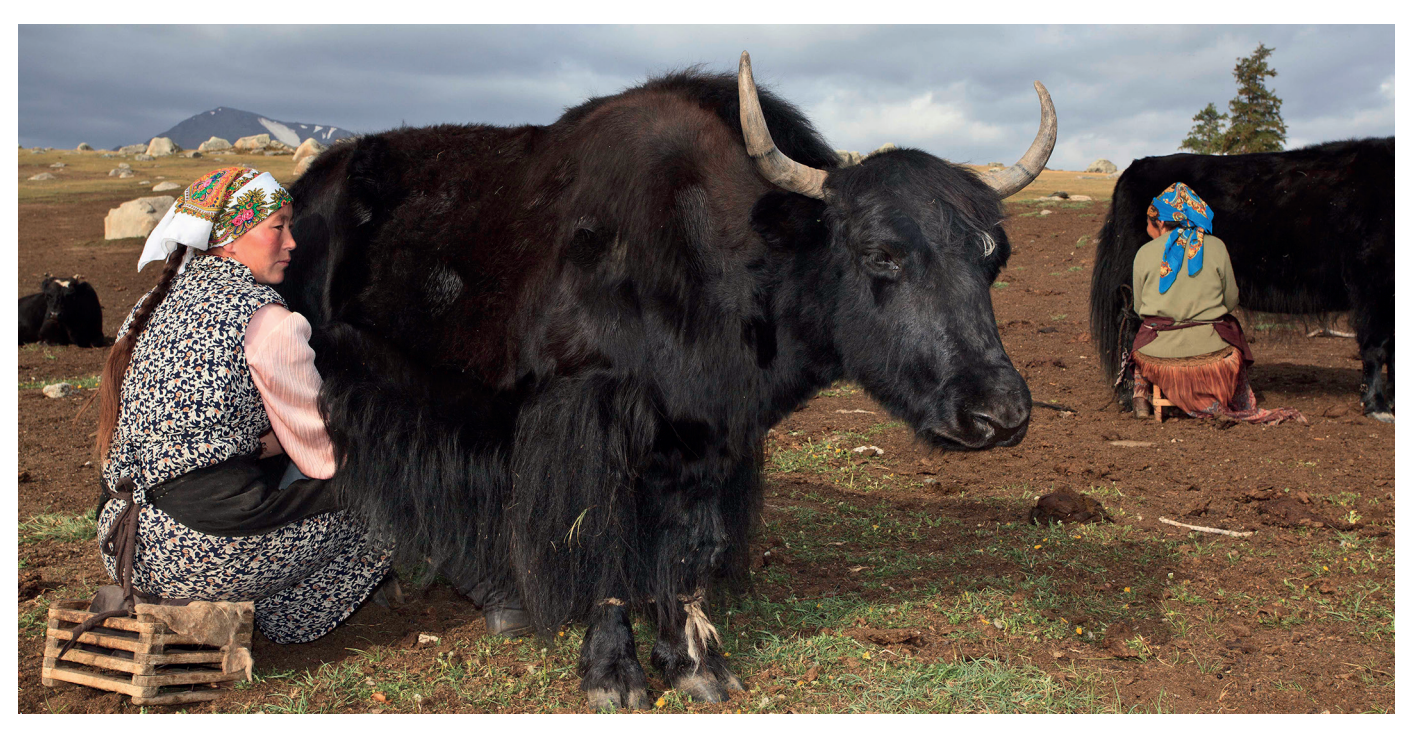
Women milking yak, Mongolia.

gender inequalities and empowering women and men with equal rights to land. Now, in the process of elaborating sustainable development goals in the post-2015 development framework, women's activists, NGOs, international organisations and governments such as Switzerland support the inclusion of a twin track gender approach: A stand-alone goal on gender equality, women's and girls' empowerment and women's human rights, as well as the transversal integration of gender equality in all other goals. Equal rights to land are an important target under the stand-alone goal and are also integrated in a number of other goals (OECD 2013; Swiss Position on a Framework for Sustainable Development Post-2015 2014: 19; UN Women 2013).