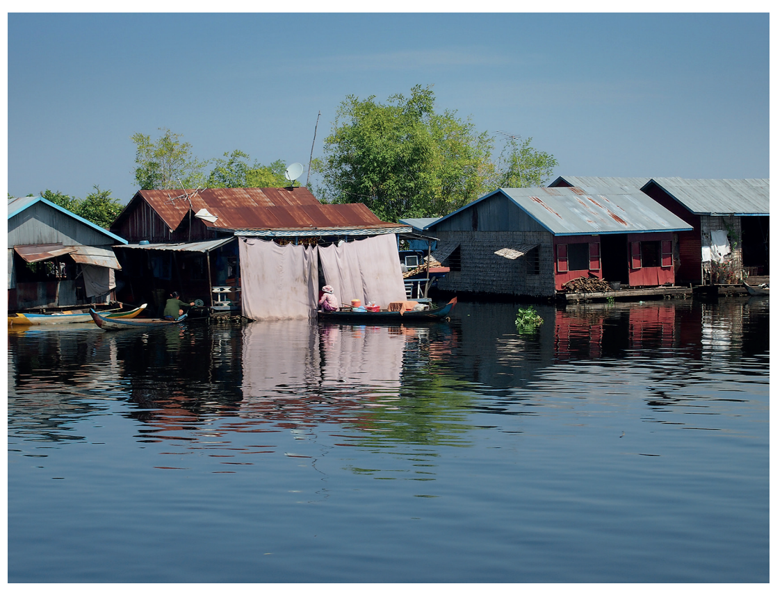
Floating houses, Cambodia.

In the literature, it is widely acknowledged that climate change does affect women and men differently and that they have different coping capabilities with the effects of climate change – the impact of climate change is not gender-neutral. On the