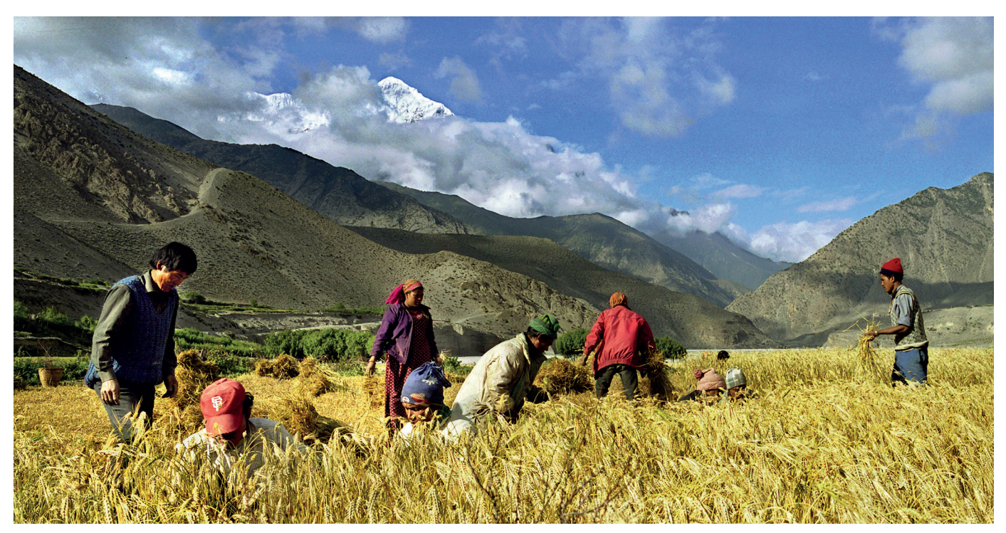
Harvest in Kagbeni, Nepal.

and this often threatens their breadwinner role, contributing to increased stress, violence and male migration in search for other income opportunities (ICFG/SDC 2013). On the other hand, coping and adaptive capabilities to respond to the effects of climate change are also influenced by gender inequalities in land rights and gendered social roles and they hinder women from responding effectively to climate risks - even when several studies have shown that women have very effective strategies for responding to climate change. It is therefore important that responses to climate change take these inequalities into account and that women not be addressed as passive actors, but as potential agents for change (Action Aid 2010: 26; Aguilar 2014; IFAD 2014: 7; Sieber 2014; UNDP 2012: 2).