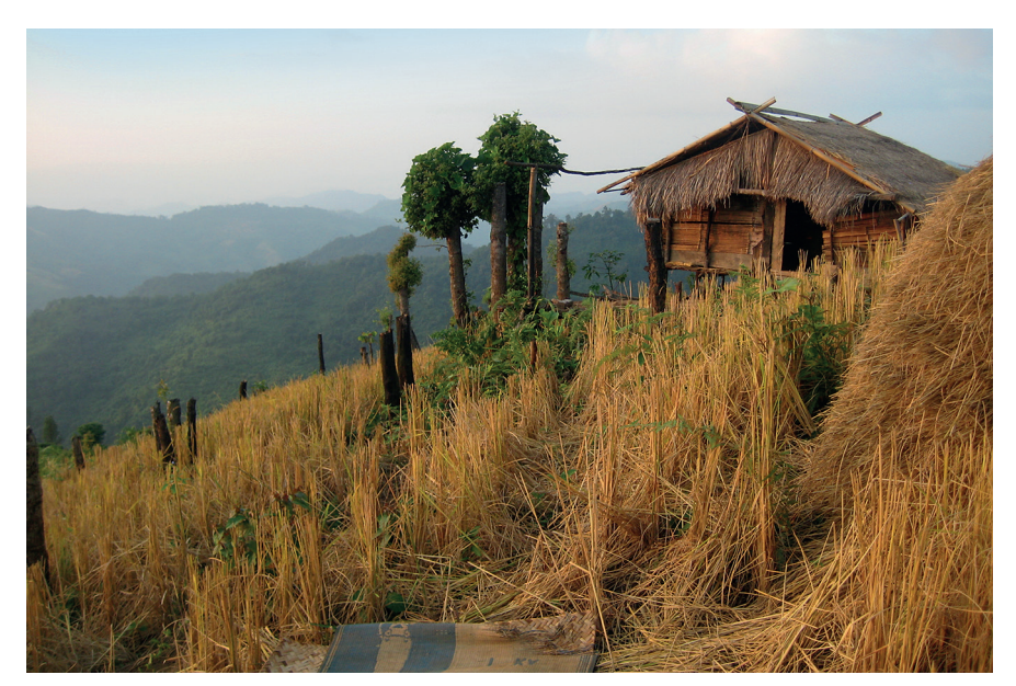
Landscape of northern Laos.