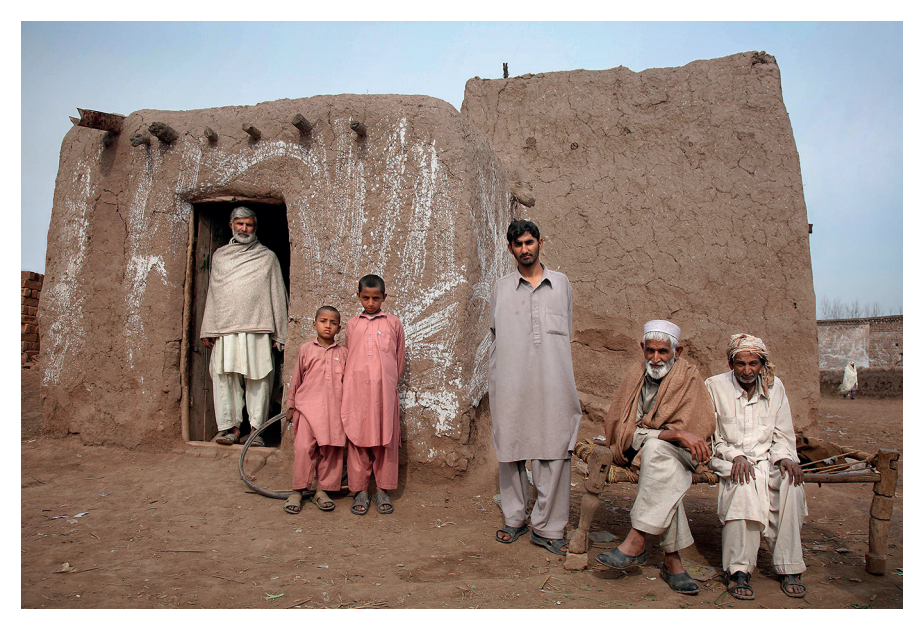
Four generations in Swabi, Pakistan.