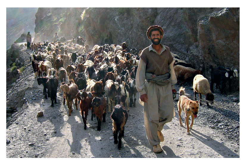
Shepherd with goat caravan, Pakistan.