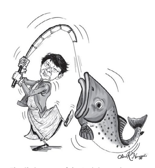
The Chairperson of the Anti-Corruption Commission, Ms. Neten Zangmo, catches a big fish. Illustration about the "Gyelpozhing Land Case" in the "Bhutan Observer".

prosecuting authorities denied taking up the case. Ultimately, the convictions of the National Assembly Speaker and the Home Minister were upheld in Bhutan's Supreme Court.