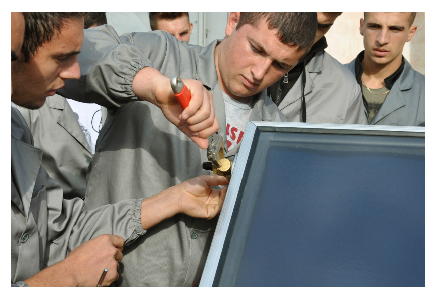
Students in thermo-hydraulics, Albania (2014)

The Swiss Agency for Development and Cooperation (SDC) implements Vocational Education and Training (VET) projects in the Western Balkans. These projects have the purpose of meeting the salient need to increase youth employment during the transition from centrally planned systems to modern market economies. With the collapse of the solid public enterprises from earlier times public vocational schools have lost their traditional partners for workshop-based training and have not been able to meet the requirements of the private sector. In this context, the SDC has applied the success factors of the Swiss VET system as an effective approach to improving the relevance and performance of the VET systems.