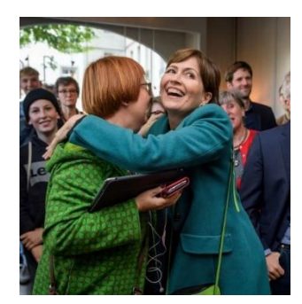
Images in most media primarily featured women politicians from the green parties.

discussed who was to blame and the likely consequences for CS. The tonality in regards to the bank was entirely negative in tone. Some media considered the incidents damaging to the reputation of the Swiss financial centre as a