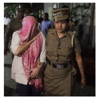
The arrest of a local employee of the Swiss Embassy in Colombo.