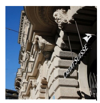
Most coverage of the corporate espionage scandals was accompanied by symbolic images.