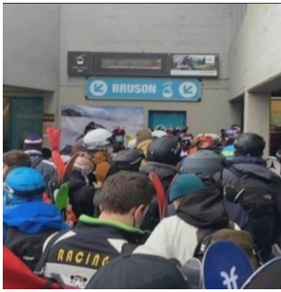
COVID-19: Crowd of people waiting for a ski lift

social responsibility aspects of global supply chains. The press coverage also referred to the large number of multinationals operating in Switzerland.