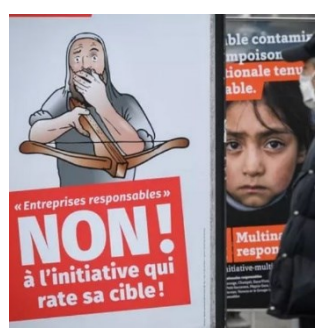
Posters publicising the Responsible Business Initiative