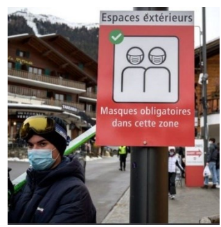
COVID-19: coverage focusing on open ski resorts