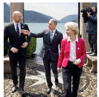
Ignazio Cassis with the Ukrainian prime minister and the EU Commission president on the shores of Lake Lugano.