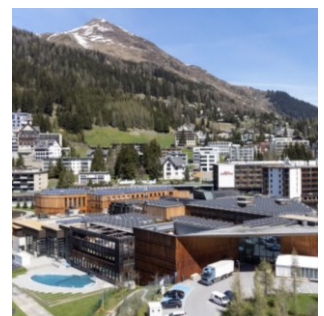
Coverage of the World Economic Forum, which takes place in May, is often illustrated with images of snow-free Davos.

A considerable number of foreign media outlets reported on this year's World Economic Forum in Davos, which took place in situ after a two-year gap. The number of reports was slightly lower than previous editions, however. The reporting focuses on the Ukrainian President Selensky's speech and Russia's non-participation. Coverage