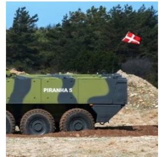
Swiss-made military vehicles like the Mowag Piranha 5 may not be sent to Ukraine.

context was often highly critical. The Swiss position on security policy also came under scrutiny with the announcement by Finland and Sweden of their intention to join NATO. In this context, and with frequent references to Switzerland's internal political debate, foreign media outlets discussed the extent to which the Swiss understanding of neutrality should be adapted to reflect the new global peace and security order. President of the Swiss Confederation Ignazio Cassis appeared in a number of guest contributions in Western international media, also helping to give visibility to Switzerland's position on its neutrality and how this is implemented. At the other end of the scale, Russian media has accused Switzerland of losing all credibility as a neutral country by adopting the sanctions against Russia in full. Switzerland's election to the UN Security Council in June, however, resulted in some more nuanced reporting – such as on the distinction between neutrality law and neutrality policy.