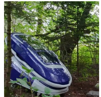
The 'Sarco' suicide capsule in a forest in Switzerland, where it was used for the first time in September.