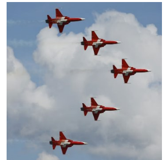
Patrouille Suisse jets illustrate an article on the rapprochement with NATO and the EU recommended by the security policy study commission.