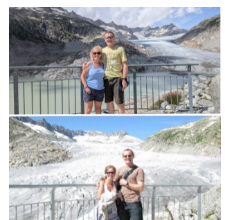
Two pictures taken by a tourist 15 years apart from the same spot showing the enormous retreat of the Rhone glacier went viral on social media.