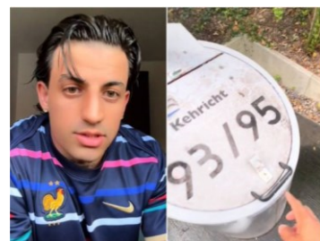
On the TikTok account suiza.en.español , a Spaniard living in Switzerland explains how strict and, above all, expensive Swiss waste disposal regulations can be.

In terms of content, the articles range from concrete help and tips for new arrivals in the country to factual explanations of everyday life in Switzerland. Sometimes social characteristics, such as perceived prejudices among locals towards different migration groups, are also addressed critically. Video clips on social media such as TikTok, Instagram etc. make it possible to convey personal experiences of a diaspora in Switzerland in a lively, everyday way. Picked up subsequently in the print media, they play a significant role in shaping perceptions of Switzerland abroad.