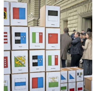
Signatures collected for the popular initiative 'Yes to fair OASI pensions for married couples too', submitted on 27 March 2024.

Switzerland's direct democracy, with its various instruments, garnered media interest abroad in various contexts. Several articles provided objective coverage of suspected irregularities in the commercial collection of signatures for popular initiatives in Switzerland, portraying Switzerland's political system as unique and in fundamentally positive terms, but at times critical of possible weaknesses.