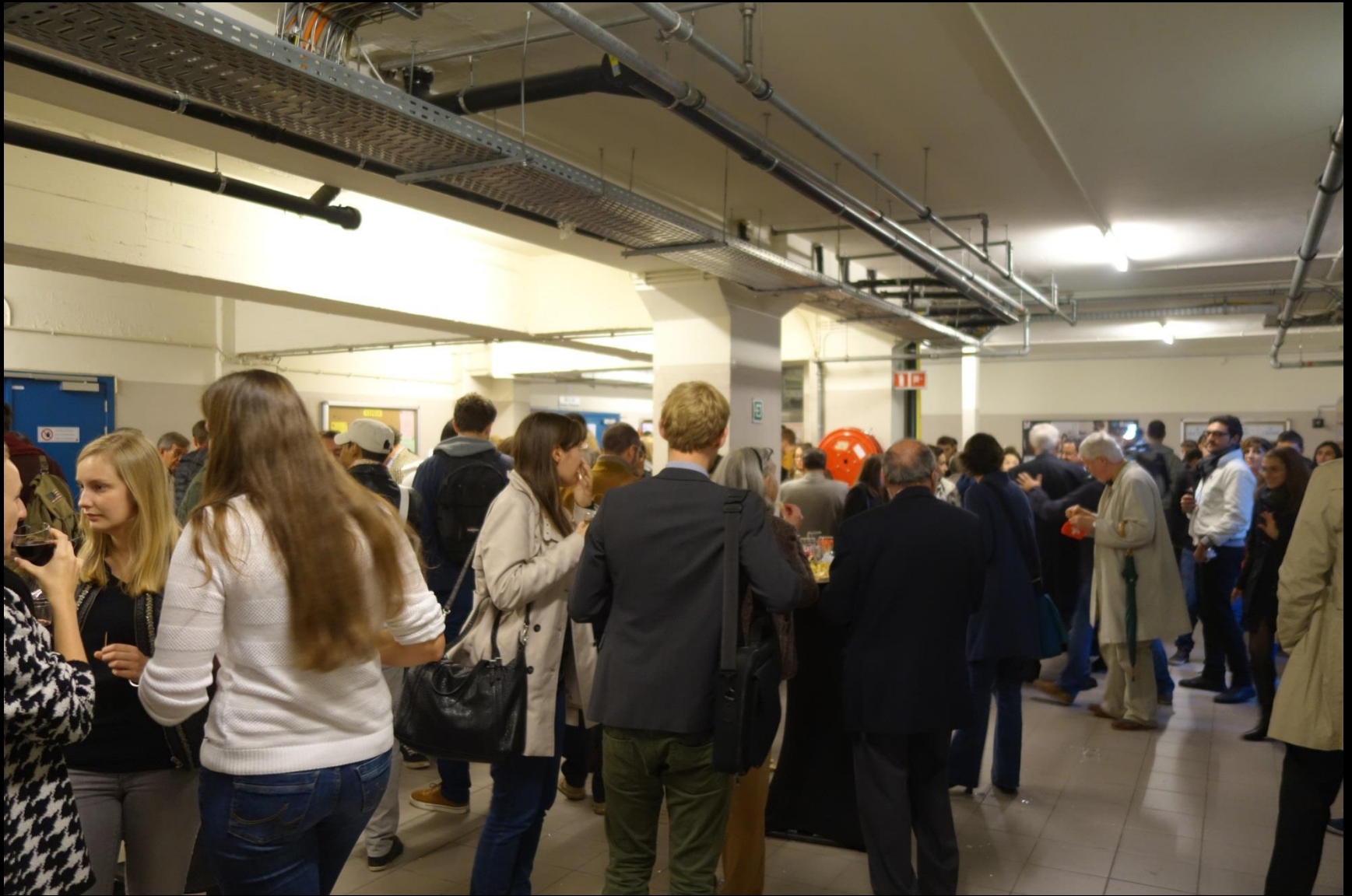
Swiss welcome drink