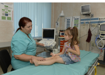
The SDC is helping Moldova to ensure that children in all regions of the country receive the best possible medical care.

The health status of Moldova's population is well below the European average. Average life expectancy is 70 years. Universal access to basic healthcare is not guaranteed, especially in rural areas, and the population is insufficiently protected against financial risks associated with high healthcare expenses. The SDC therefore supports the Republic of Moldova in its efforts to reform the health system in order to provide high-quality health services that are accessible to all citizens. Another focus of Swiss-supported activities is on awareness-raising measures to prevent non-communicable diseases (e.g. diabetes, cardiovascular diseases, cancer) and to highlight the long-term benefits of a healthy lifestyle. With Swiss support, a network of 41 Youth-Friendly Health Centres have been created throughout the country, while 40 Community Mental Health Centres are advancing reforms of mental health system.