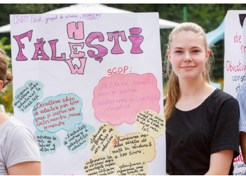
Proud youth group member of the civic education project is presenting the vision and planned activities in their community, summer camp, Moldova, 2019.

chains including the regulatory framework and business support services that will lead to private sector growth thus creating more and better jobs.