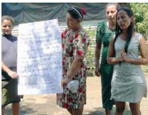
Water committee with female participation in Nicaragua

Experiences in Nicaragua are especially positive. Women now have more of a voice in decision-making, and the construction of school latrines allows girls the carefree attendance of school.