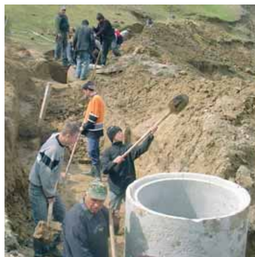
Cooperation of the Moldovan population

Some of these programs have a long history. In individual regions, the Swiss commit-