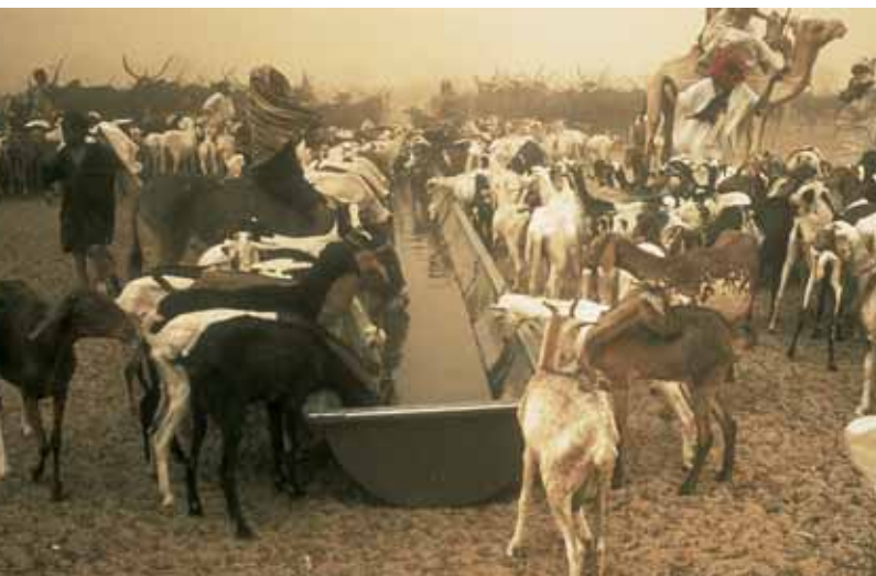
Cattle trough at a water pump in Niger