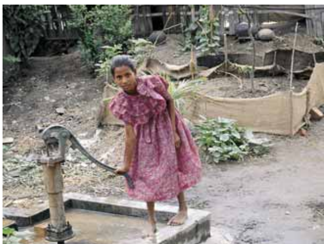
Hand pump in Bangladesh

Moreover, the waste disposal components (sewage water, latrines) in most drinking water programs must be reinforced. This becomes increasingly important as wastewater accumulates with the improvement of the drinking water supply.