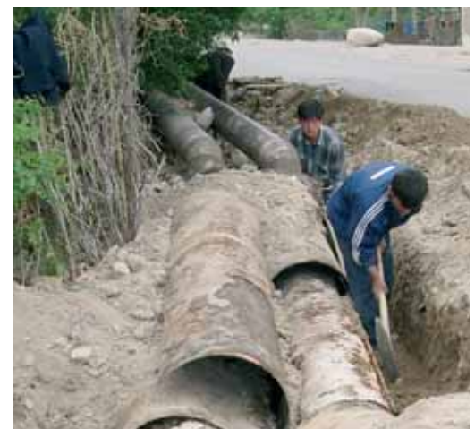
Modification of distribution network in Khujand

In dry regions such as Niger it was possible to increase water availability with some simple measures. In Téra (Niger) weirs were built in the riverbed causing the groundwater level in