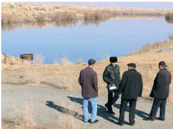
Wastewater clarifiers 30 km outside of Nukus