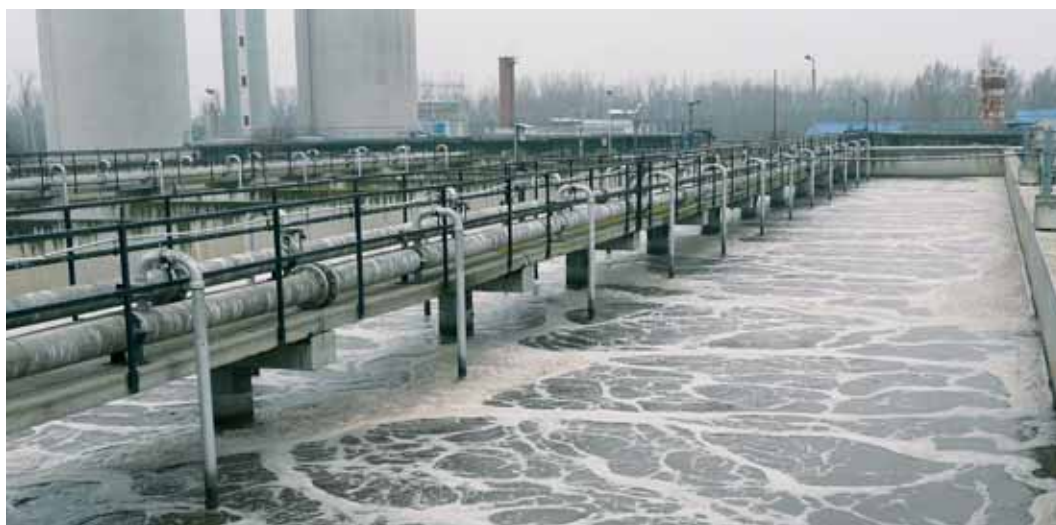
Sewage treatment plant in Debrecen, Hungary