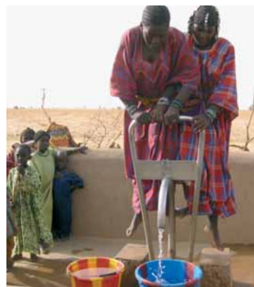
Benefits result especially for women and children

Water programs in remote and poor areas also yielded good results, despite the exclu-