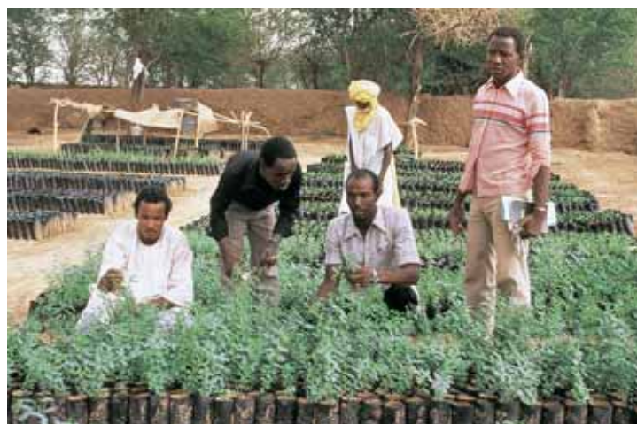
Higher production with irrigation: Tree nursery in Niger