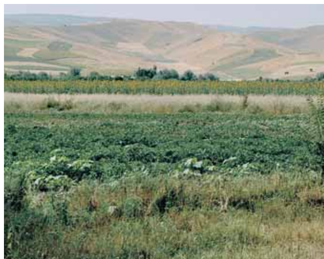
Agriculture in the Ferghana Valley depends on irrigation