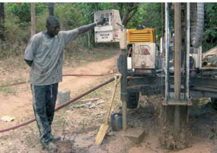
Borehole in Africa

– The Water Supply & Sanitation Collaborative Council (WSSCC) succeeded through