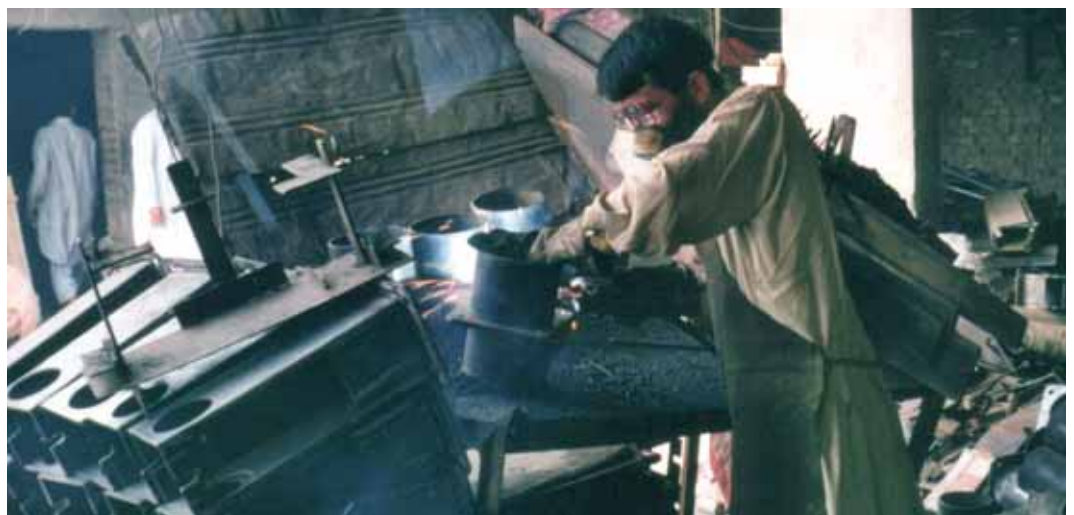
Production of hand pumps by small local businesses, India

A major part of these effects is directly related to good governance. The state was strengthened both locally and nationally so that it can