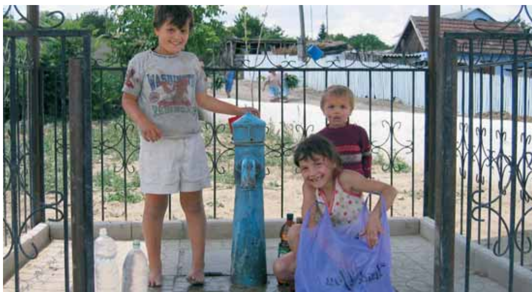
Public water supply site in Moldova

Problems with sustainability are found especially in poor countries, particularly when water rates do not cover actual water