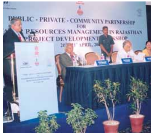
Founding of a public-private partnership in India

By promoting the MRC Secretariat, Switzerland helped to establish a regional cross-national institution in a region that until just recently was wracked by conflict. The Mekong region is the scene of rapid economic growth, especially with respect to trade (river boats) and dam construction for the electricity industry.