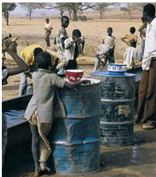
Public water supply site in Niger

Meanwhile, the aforementioned health benefits achieved by the Swiss program in Bangladesh are also endangered. The health of more than 50% of the population is now